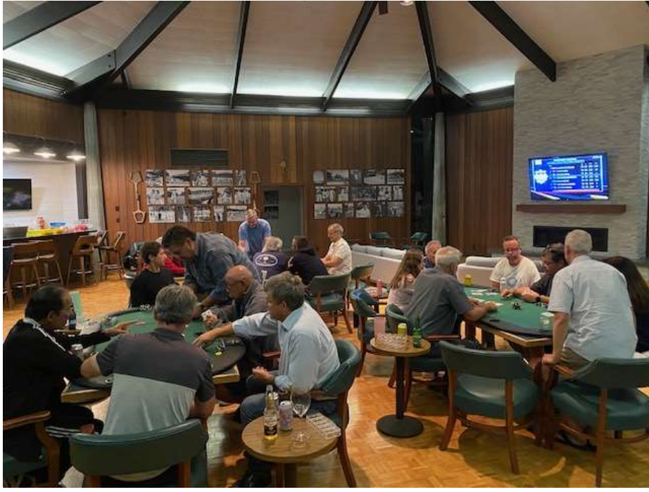
No bluffing in with this crowd...