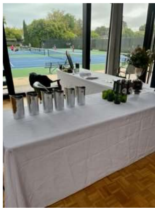
Betty Cookson Trophies on display