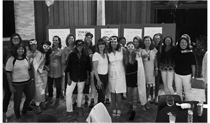
Women's Calcutta Friday Night Draw