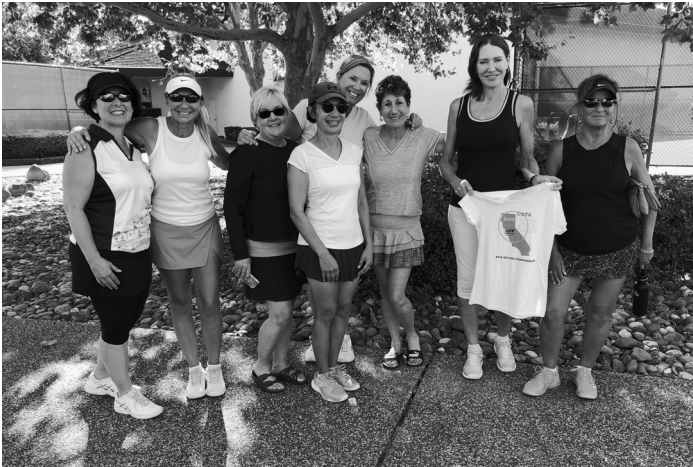
Womans 55's 8.0 Team at Districts in Roseville