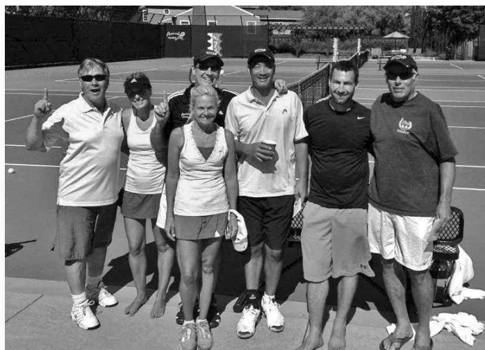
FIRST PLACE TEAM