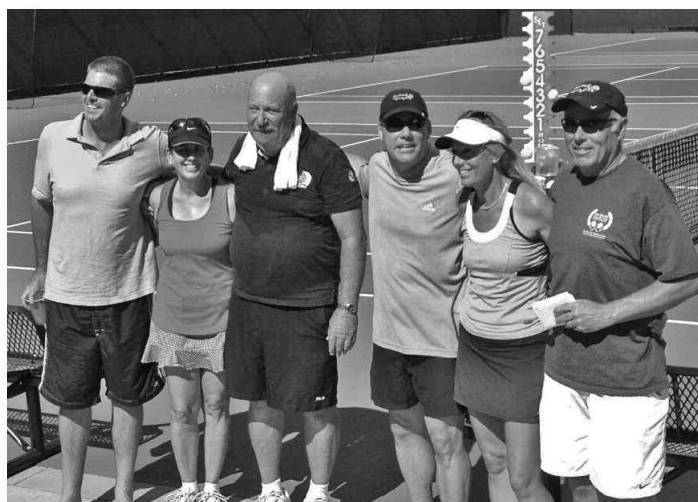
SECOND PLACE TEAM