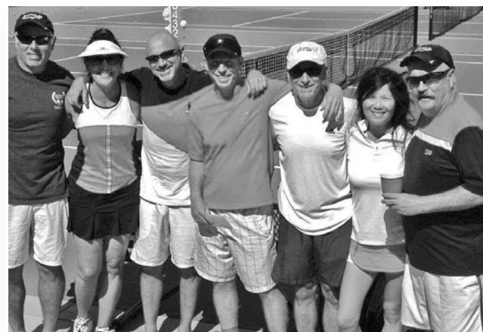
THIRD PLACE TEAM