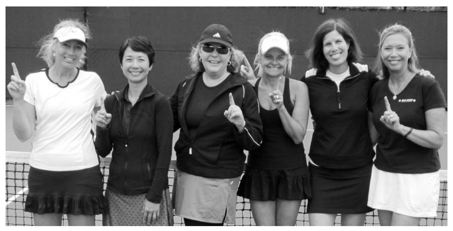
2011 Calcutta Womens Champions