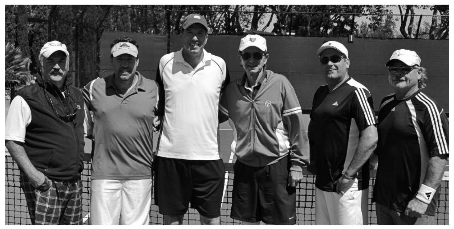
2011 Calcutta Mens Champions