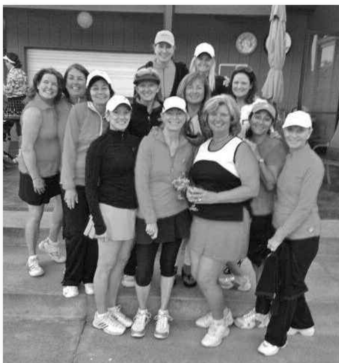
Women's 3.5 Team