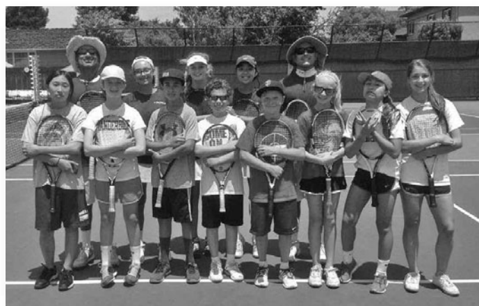
Junior Tennis Fun!