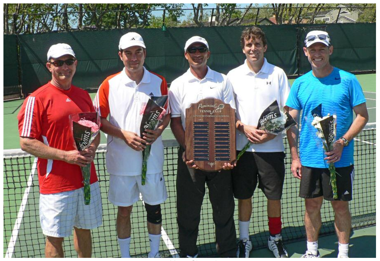
2012 Mens Champions