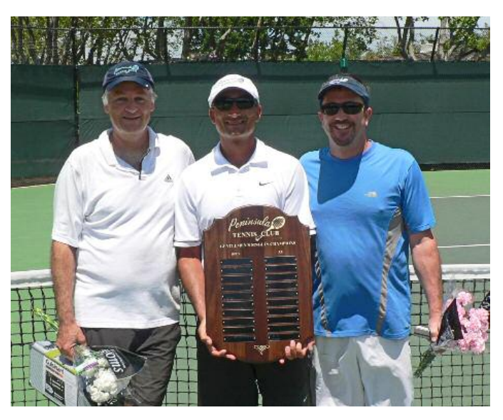
2012 Open Consolation Finalist