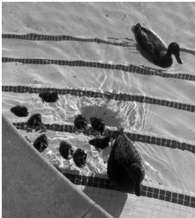
The Clubs Duck Family is Back

As mentioned above, the Spring Fling is around the corner. After the competition (approximately 4:00 pm), we will be hosting a cocktail party. The theme of this event is the Kentucky Derby. We are excited for this event and while we would like everyone to attend, we do need those wishing to attend to sign up. Tennis and party sign-up sheets are posted on the bulletin board outside of snack bar. Cost is $20 for tennis and dinner and $10 for dinner and cocktail party (charged to your account). Signing up helps to give us an accurate head count for dinner and cocktails. With that said, we will be serving a full dinner along with a signature cocktail (mint julep), wine and beer. We will also have a contest for those wishing to wear decorated hats and will award prizes to the winners. We encourage those women playing in the tennis event to decorate their visors. Come on out and enjoy the celebration. See you all at Spring Fling.