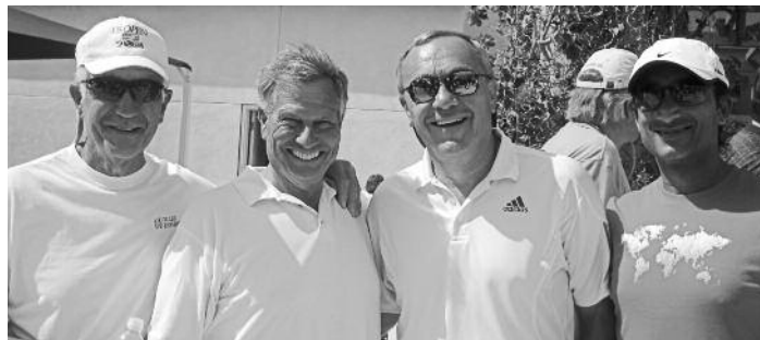
What happens in Palm Springs stays in Palm Springs