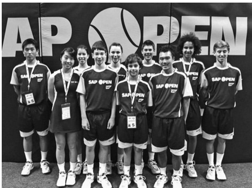
2011 SAP Ball Kids