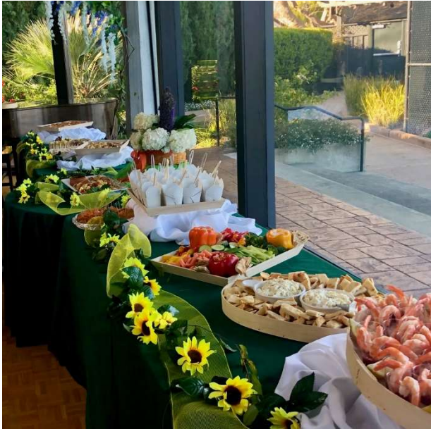
Spring Fling After-Party