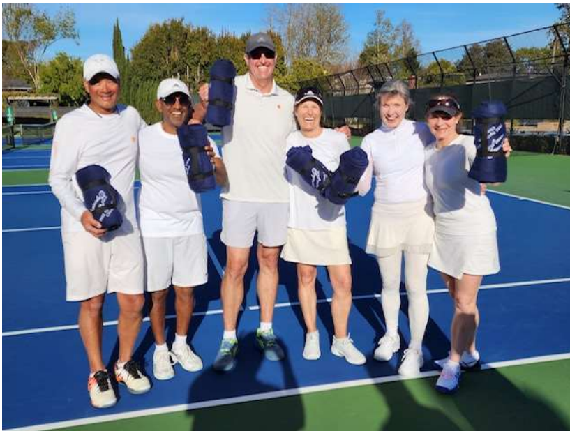
Spring Fling Champions