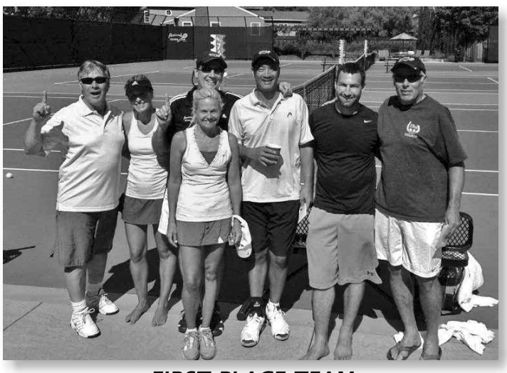
FIRST PLACE TEAM