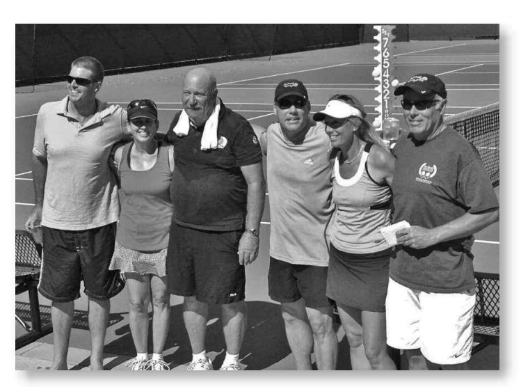
SECOND PLACE TEAM