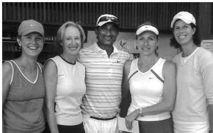
Women's Calcutta Team Captains