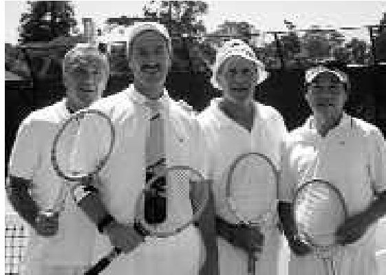
Men's Calcutta Team Captains

Looking forward to seeing you on the hard courts!