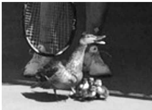
The PTC Duck Family