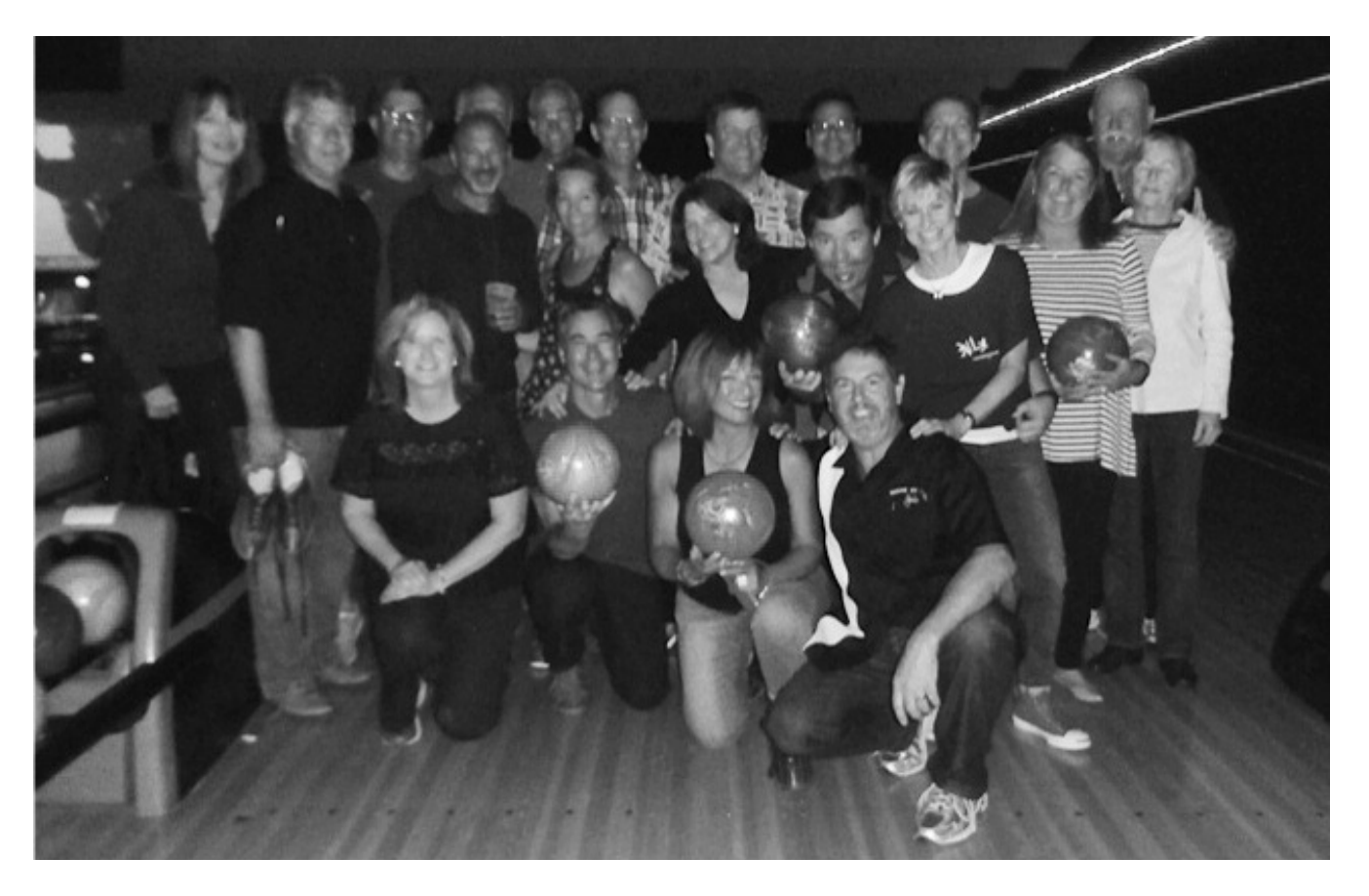
Peninsula Tennis Club ~ 81 Years of Tennis