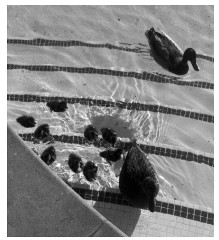
The Clubs Duck Family is Back

As mentioned above, the Spring Fling is around the corner. After the competition (approximately 4:00 pm), we will be hosting a cocktail party. The theme of this event is the Kentucky Derby. We are excited for this event and while we would like everyone to attend, we do need those wishing to attend to sign up. Tennis and party sign-up sheets are posted on the bulletin board outside of snack bar. Cost is $20 for tennis and dinner and $10 for dinner and cocktail party (charged to your account). Signing up helps to give us an accurate head count for dinner and cocktails. With that said, we will be serving a full dinner along with a signature cocktail (mint julep), wine and beer. We will also have a contest for those wishing to wear decorated hats and will award prizes to the winners. We encourage those women playing in the tennis event to decorate their visors. Come on out and enjoy the celebration. See you all at Spring Fling.