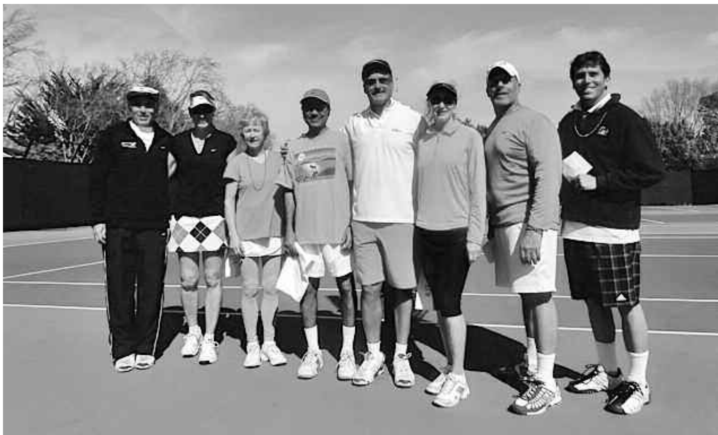
2013 Team Tennis - Second Place