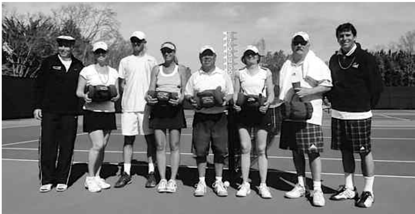
2013 Team Tennis - Winners